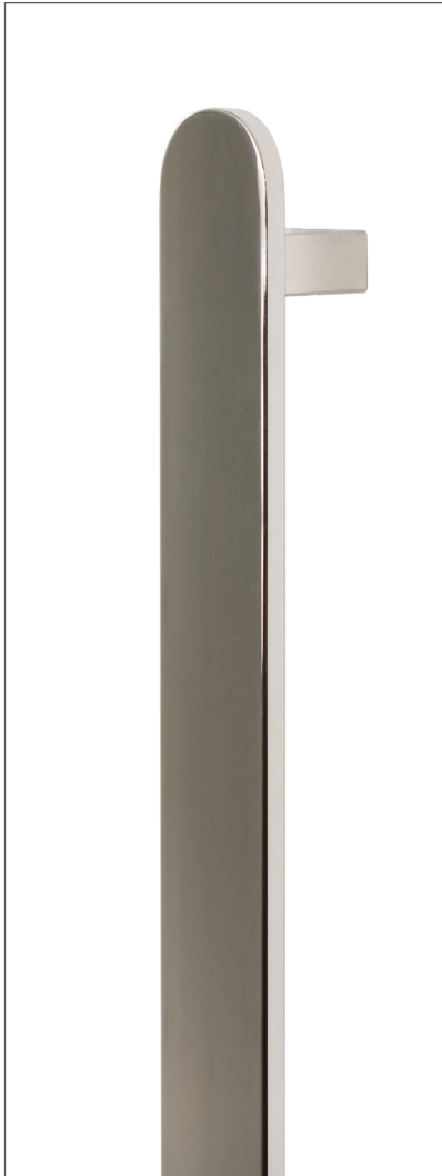
Diamond Polished Stainless Steel