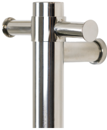
Diamond Polished Stainless Steel