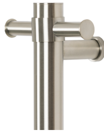
Brushed Stainless Steel